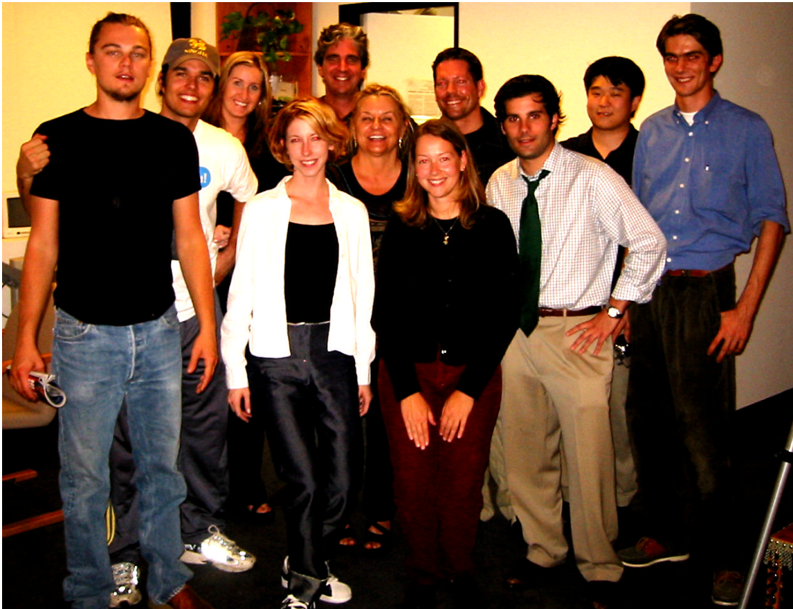
the LA chat team